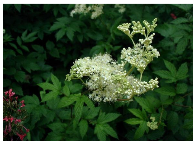
Meadowsweet ( Filipendula Ulmaria )