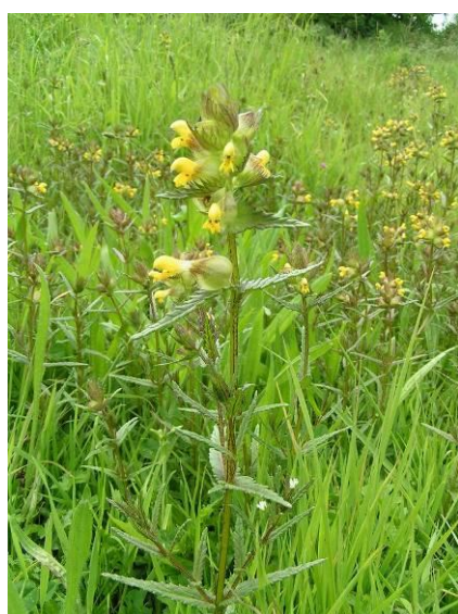
Yellow Rattle ( Rhinanthus Minor )