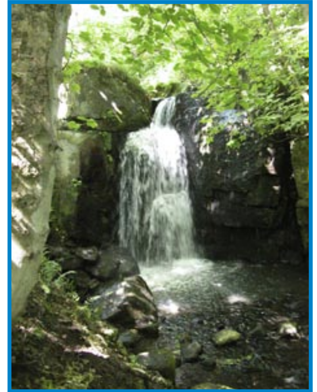
A waterfall in the Lumsdale Valley