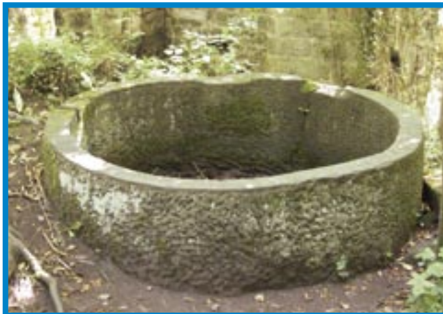
The large trough, carved from a single block of stone, used in the bleaching process