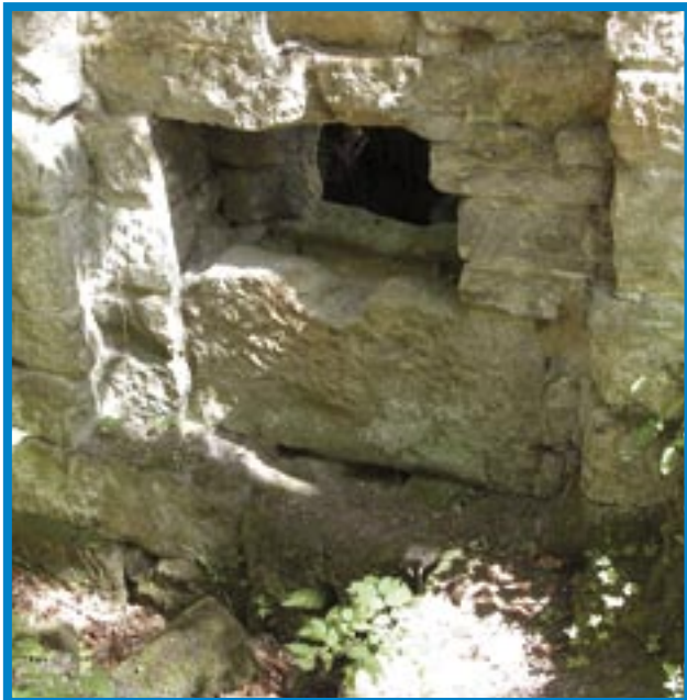
Detail of the stone which held the axle of the waterwheel at the Paint Mill

The site is owned by the Arkwright Society and is open to the public. During the summer guided tours are provided, and details of these available at Cromford Mill or on the Arkwright Society's website.