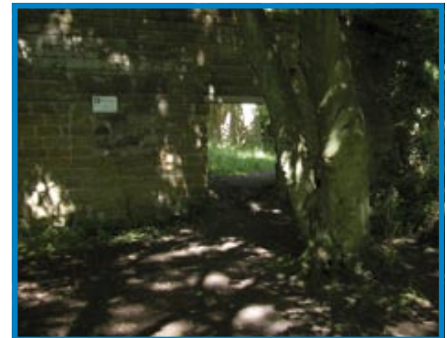
The sun shining through the leaves gives the ruined mills a romantic atmosphere