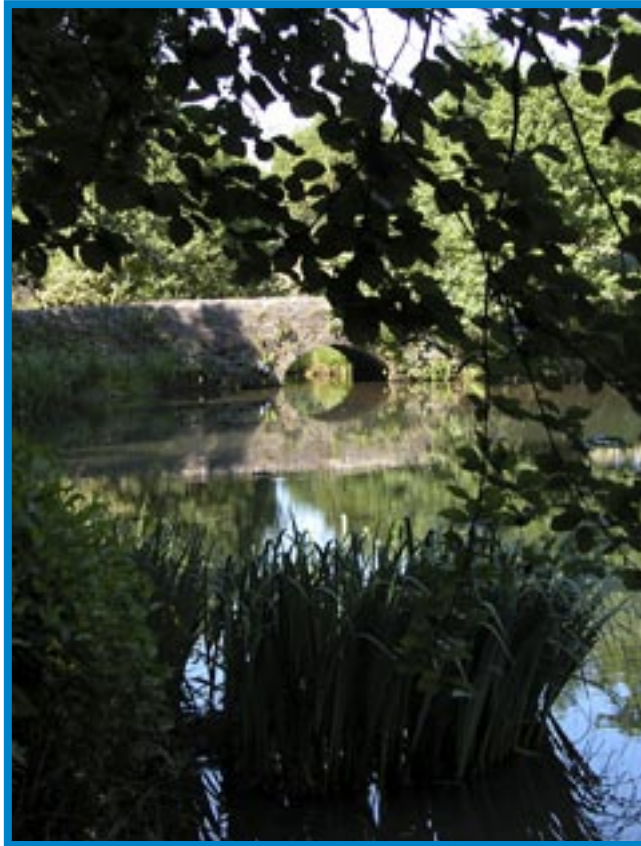
A view of the bridge by the Lower Pond